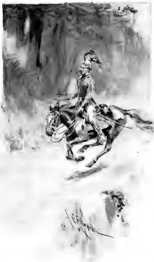
"AND SEE, ALONG THAT MOUNTAIN-SLOPE A FIERY, HORSEMAN RIDE." Page 101.